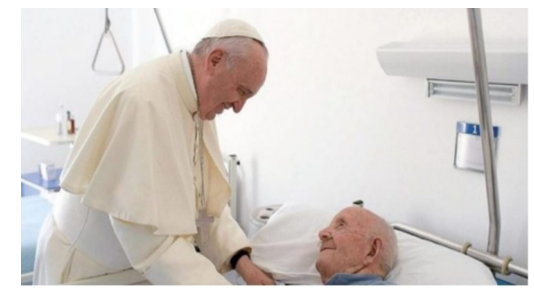
World Day of the Sick

Echoing the Holy Father's message, the Canadian Conference of Catholic Bishops (CCCB) renews its commitment to prayer and accompaniment of the sick. Our parish should find encouragement in our renewed Pastoral Care ministry which is now celebrating Mass in institutions of care and is visiting the sick with Communion. If any would like to join this compassionate ministry please contact our office or fill out a Welcome/Inquiry sheet.