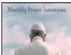
Monthly Prayer Intentions

Sacrament of Reconciliation :30 mins prior to weekday Masses or by appointment.